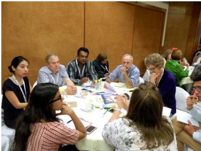
MenCare friends and partners discuss global advocacy for involving men and boys in caregiving at the State of the World's Fathers advocacy workshop on November 10.

Check out this resource (and more) on the World Policy Forum's Convention on the Rights of the Child resource hub here .